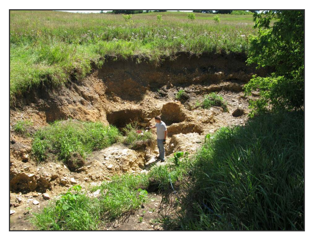
Natural Entrance Sinkhole. The area around the pit was excavated to bedrock.