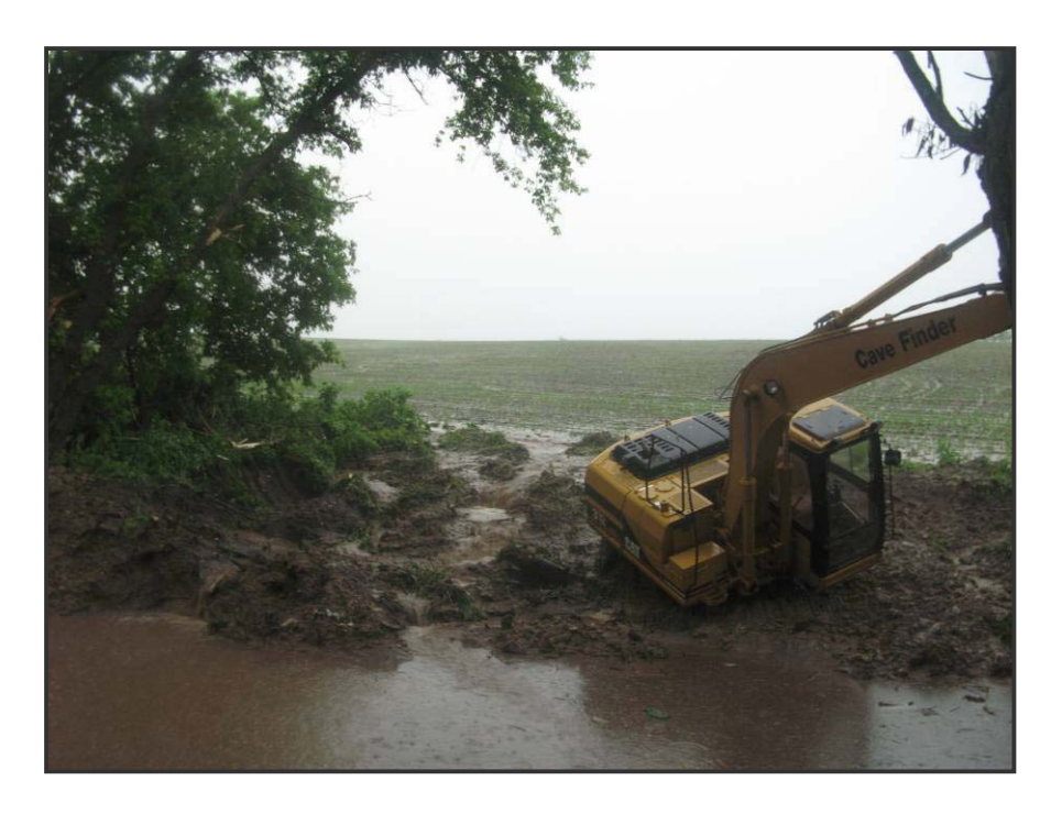
This is what was left over. The Cave Finder was almost carried into the 65' pit, which filled with muck. Our project was essentially destroyed.

This was a catastrophic supercell rain event, which spawned brief hail, tornadoes and damaging winds. Eleven inches of rain pounded down in a short period of time. The following day the adjacent county declared a State of Emergency. Major roads were closed, and the nearby town of Granger, located along the Upper Iowa River, was surrounded by water. The Upper Iowa River, located a short walk from the excavation site, crested at record level.