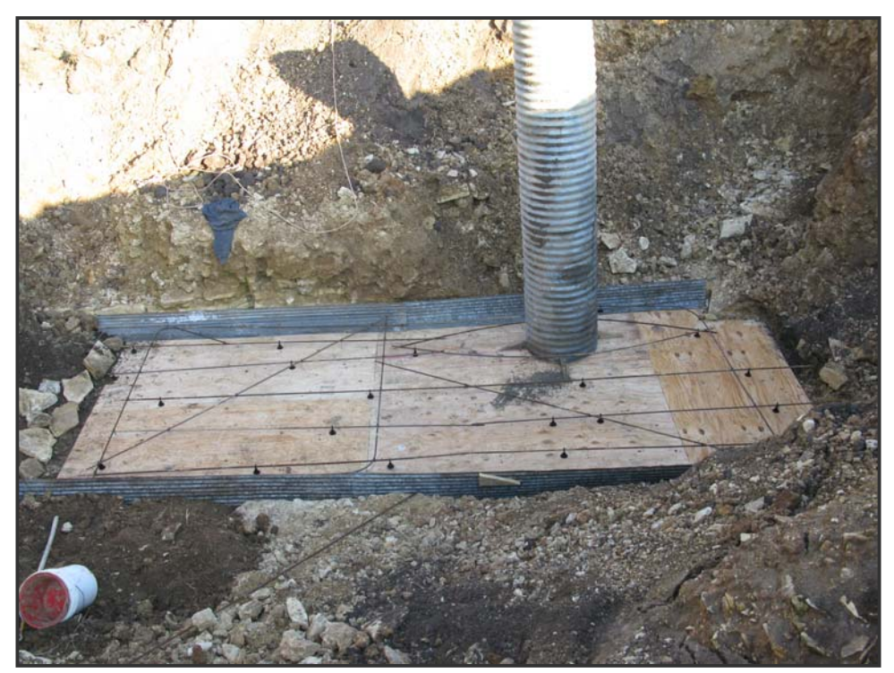
Sheets of tin were placed along the perimeter to form a tight seal. A temporary culvert access to the cave was installed.