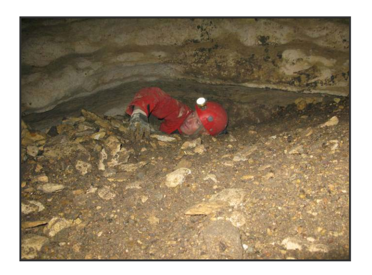
Squeezing through after removing blockage.

Then I climbed up into a second spacious room. This time a considerable walking-sized passage led off into the distance, which I began to follow. Adrenalin was pumping through my bloodstream as I screamed "YES! After several hundred feet I could see and hear something change up ahead. Then, beyond any expectation that I may have had, I walked right into open blackness. The passage went to my right and to my left, as far as my eyes could see. As I stood there in awe I whispered "Oh my God" over and over. I turned around, and at breakneck speed