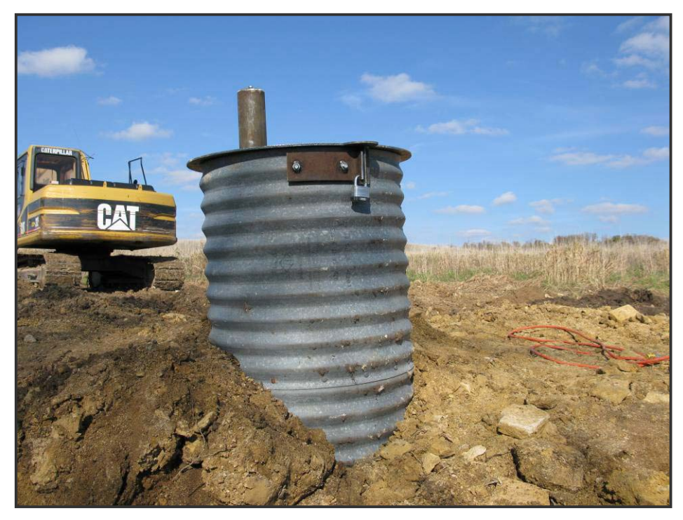
The new entrance will be located about 350' away. Once the new entrance is completed this temporary entrance will be removed. The site will be graded and replanted with native grasses.