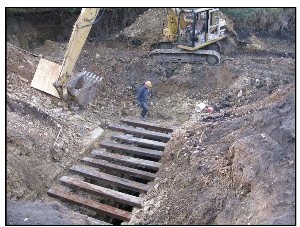
After the bedrock was exposed, structural steel tubing was placed over the open hole. Then thick plywood was placed over the beams and rebar was installed.