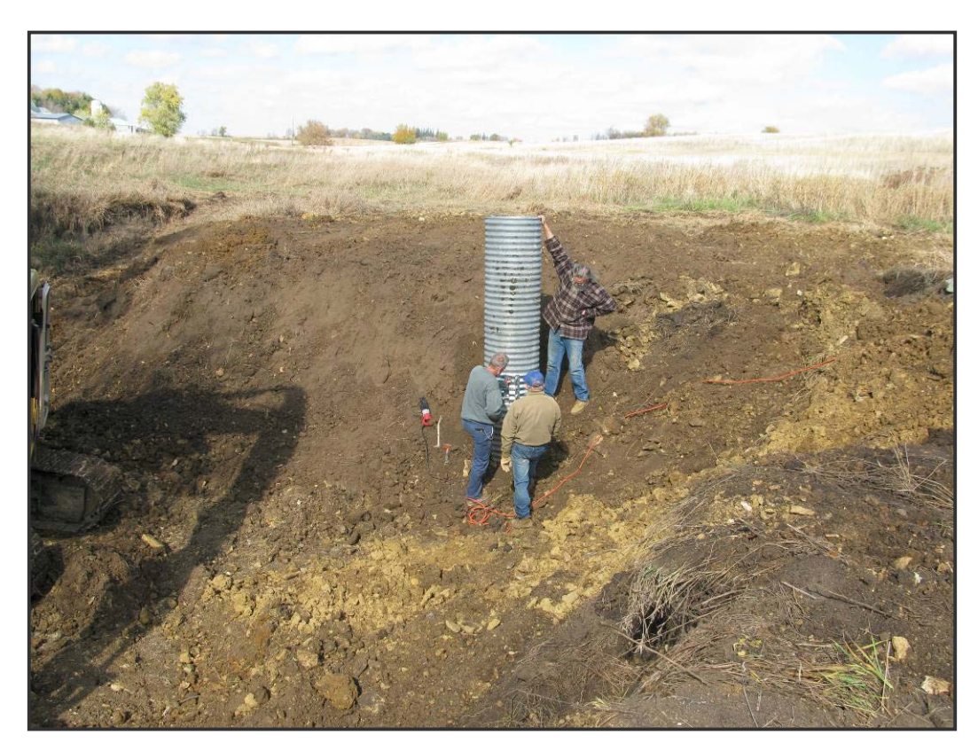
The site was partially backfilled and a culvert extension was added.