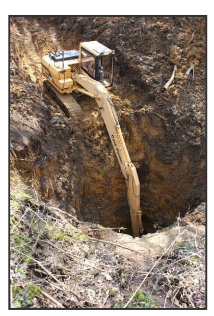
Near Odessa Spring

within sight of Odessa Spring, and just west of Niagara Cave. Based on years of excavating sinkholes, I have shown that at the base of every sinkhole there lies at least one cave passage. My fellow cavers and I vowed to dig this sinkhole all the way down to China if necessary, until we tapped into the passage that we surmised would lead us into the nearby York/Odessa System.