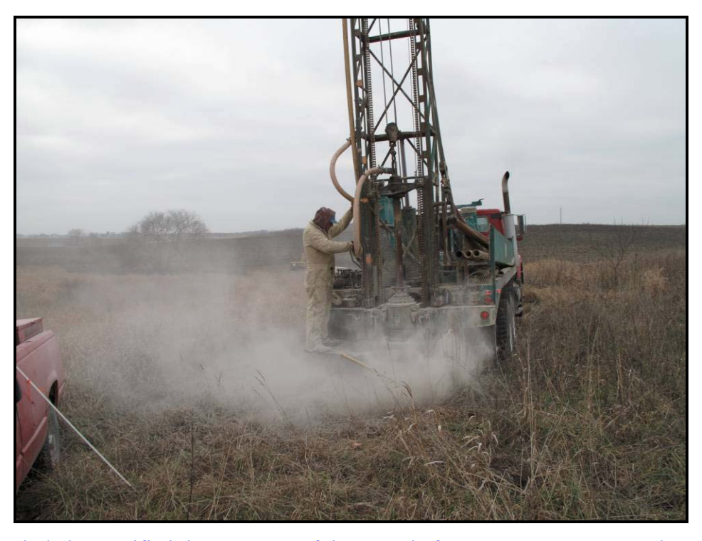
A small test hole has verified the accuracy of the new shaft entrance. Next up: A large industrial drill rig and a host of support equipment will now arrive to create the actual entrance.