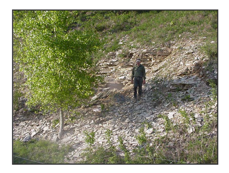
Blasting into the cave. Notice the smoke.