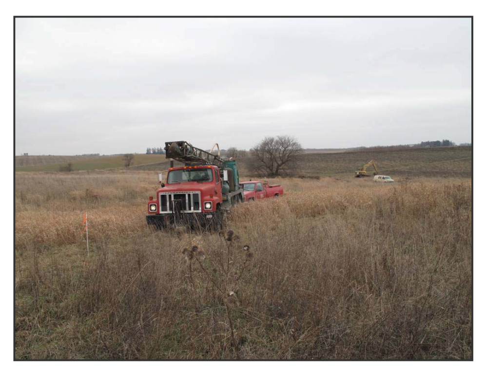
Future entrance site. Sinkhole collapse natural entrance is located near the large tree.