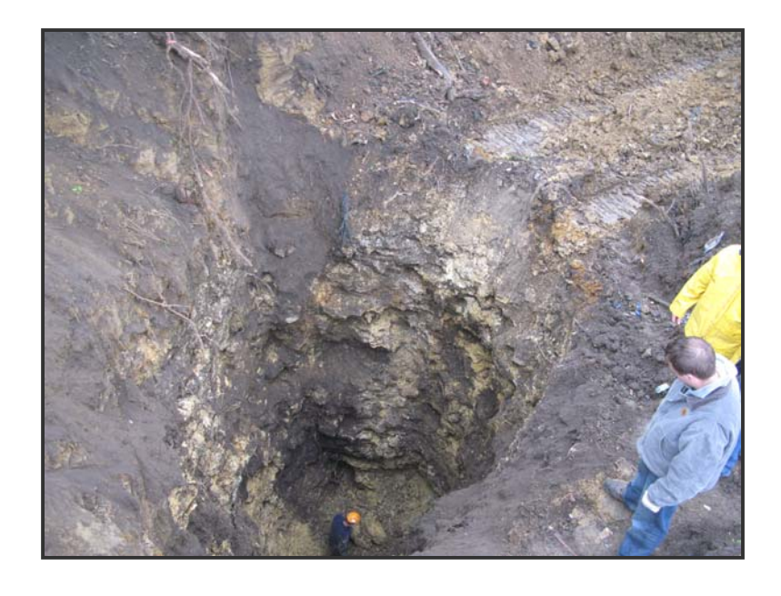
Clay Kraus checks for cave signs before hand digging, May 2008.

Eventually we began to pick up cave signs. Because we could not dig any deeper using machinery we began to excavate by hand. When we reached the 40' level voids began to appear. A large tank and culvert were set in place for protection against a collapse. Sure enough, a spacious cave passage was discovered 65' below the surface!